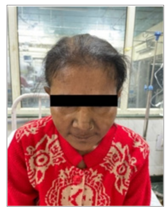
Figure 1.Photograph of Patient Showing Alopecia and Wrinkling of Skin

Her hormone profile was suggestive of low serum cortisol, free T3, free T4, LH, FSH and serum prolactin. Her thyroid stimulating hormone was in the lower range of normal despite low levels of free T3 and T4. The adrenocorticotropic hormone was also in the low normal range, and glycated haemoglobin was normal. The values of the hormone profile have been provided in Table 1. Brain magnetic resonance imaging revealed partially empty sella turcica (Figures 2a and 2b).