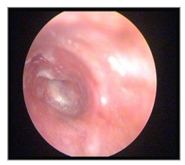
Figure 5.Post-operative Trans-endoscopic Image of Left Ear

Postoperatively, the patient was treated with intravenous antibiotics. He was asymptomatic after surgery and was followed up regularly to date (Figure 5).