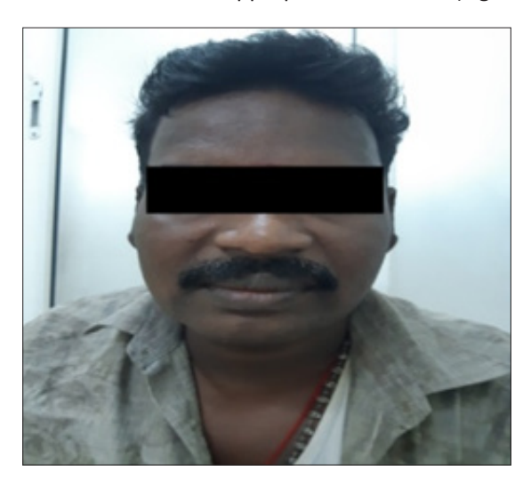
Figure I.A Picture of the Patient Involved in the Study

Institute with complaints of left ear discharge since childhood which was aggravated for the past two years. The discharge was mucoid in consistency, foul smelling, scanty in quantity, and not blood-stained. There was no history of hearing loss, tinnitus or giddiness. The patient had a past history of headache which was associated with vomiting, intermittent fever, and right hemisensory loss with left ear discharge. He was diagnosed with a left thalamic abscess and underwent left parieto-occipital craniotomy for evacuation of the left thalamic abscess on January 9, 2018. Pus culture and sensitivity of thalamic abscess showed a rare organism, Streptococcus sanguinis and the patient was treated with appropriate antibiotics (Figure 1).