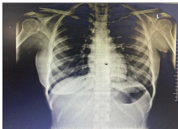
Figure 5.PA View of X-Ray after Discharge during Follow up