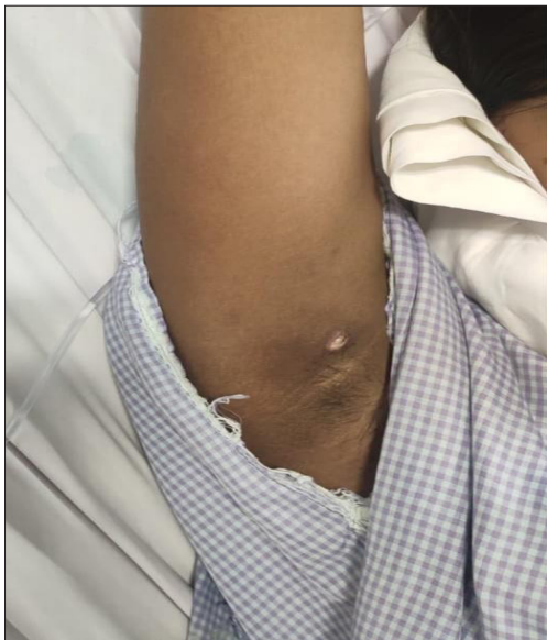
Figure 1. Eschar on Right Axilla

On day 1 of her admission, the patient complained of high-grade fever, shivering, cough, breathing difficulty, headache, and generalised weakness. She was conscious, pale, her pulse rate was 134 beats per min and regular in rhythm, respiratory rate was 36 breaths per min, blood pressure was 90/60 mmHg in the right upper arm in supine position and temperature was 102°F, SPO 2 was 84% in room air and 96% with 4 litres of oxygen supplementation via face mask. She had a non-blanching rash over the bilateral lower limb and an eschar was found in the right axilla on a thorough general examination which gave us the clue for scrub typhus (Figure 1). On examination of the respiratory system, findings were bilaterally reduced breath sounds and bilateral basal crepitations. The results of the other systems examinations were all normal.