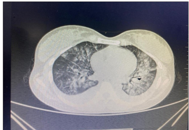
Figure 3. Computerised Tomography Chest showing Features of ARDS

Blood was sent for investigations - procalcitonin (3.45), D-dimer (5228), LDH (489), CRP (107), ferritin (369.5), IL-6 (65.16), and all cultures were sent.