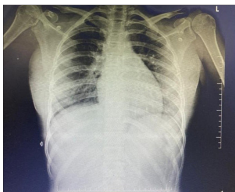
Figure 4.AP View of X-Ray showing Wedge-shaped Opacity on Right Side

After extubation, the patient maintained saturation without oxygen support. Chest physiotherapy and incentive spirometry were encouraged on a regular basis every day, but the patient continued to have persistent tachypnoea. Her serial X-rays were improving, but on day 2, after extubation, X-ray chest showed a wedge-shaped opacity in the right lower lobe of the lung (Figure 4). We suspected thrombus formation in the pulmonary artery, so we proceeded with computed tomographic pulmonary angiography, which showed an intra-luminal partial thrombus in the lobar segment of pulmonary artery on the lower lobe of right side. Therapeutic dosage of inj. Clexane twice daily, subcutaneously for 5 days was started in view of pulmonary thromboembolism, which is a rare haematological complication in scrub typhus infection. The patient symptomatically improved, and hence was discharged. She came for follow up after 2 weeks. She had no complaints and had symptomatically improved. Chest X-ray PA view was repeated which showed significant improvement in bilateral lung fields (Figure 5).