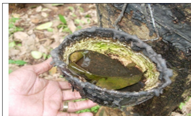
Figure 2. Latex Cup Attached to the Rubber Tree

inorganic salts, and many other minor substances. Sucrose is the major carbohydrate. 4 The presence of the remains of this nutritious latex promotes bacterial growth, which in turn serves as food for mosquito larvae and makes these ideal habitats. 5 In one hectare of rubber plantation, there