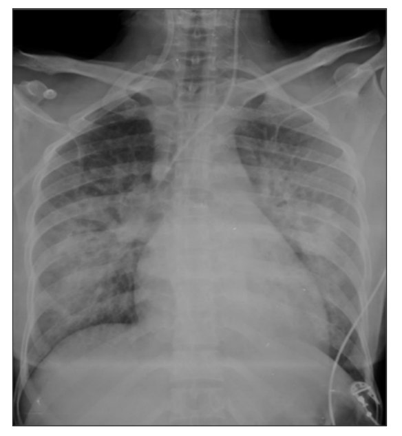
Figure 2. Chest X-ray Showing of Pulmonary Edema