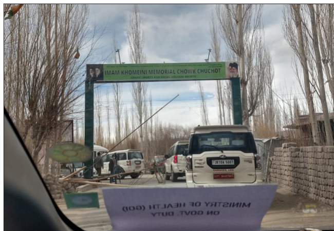
Figure 3. Containment measures in Chushot Gongma Village