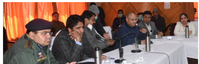
Figure 2. Administrative officers and Central team with local leaders in Kargil

A visit to Kargil district was made where inspection of isolation facility and district hospital was made by the team. Onsite instructions were made to improve the infrastructure, hygiene and sanitation of the hospitals. A meeting with all Sarpanch and Panchayat mukhiya, councillors and religious leaders was organized where presentation on COVID transmission, myths and belief systems, dos and don't were discussed. Their questions were addressed.