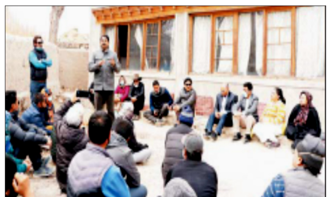
Divisional Commissioner Ladakh Saugat Siswas Interacting with people in Chuchot Gongma village.

The team visited chuchot Gongma village on 10 March 2020. The two COVID-19 cases and one suspect who later died belong to chuchot Gongma Village. The Central Team along with Divisional Commissioner, DC Leh visited village Chuchot Gongma and met the Councilor of the Village, Sarpanch, family of the deceased and few other villagers. The village has been contained since the death of suspect case on 8 March 2020. There was lot of apprehension and scare among the villagers regarding the spread of disease in their village and restriction of their movement. The Central team allayed their fears, counseled them and apprised them about how to protect themselves from the disease, precautions to be taken and ensuring strict home quarantine by the contacts of the cases. The Central team also informed them that the suspect case who died has tested negative. The administration also gave them assurance that all their necessities will be taken care.