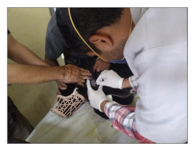
Figure 1.IDRV 0.2 ml in Pre-scapular Region in a Dog Bitten by Lab. Confirmed Rabid Dog

This involved administration of 0.2 ml of rabies vaccine Intradermal (ID) on the pre-scapular region in dogs and in the middle of the neck in lateral side of the cattle. Using an aseptic technique, 1 ml insulin syringe, 0.2 ml (up to 8 units in a 40 unit insulin syringe; i.e. 0.2 ml per ID site) of vaccine was injected into the dermal layer of skin. Insulin syringe was brought parallel to the skin making about 10° angle, after insertion of 30% portion of the insulin syringe vaccine was administered. A raised bleb about 1 cm diameter appeared immediately (Figure 1, Figure 3). While in the IM group, vaccine was administered in biceps femoris muscle in dogs. Furthermore, eRIG was infiltrated into the wounds directly by superficial and deep administration into the wound site so as to cover the entire wound surface till the depth of the wound, to ensure complete virus neutralization on the surface of the wound/s (Figure 2 and Figure 4).