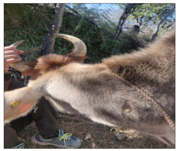
Figure 3.IDRV 0.2 ml in Middle of the Neck in a Cow Bitten by Rabid Dog