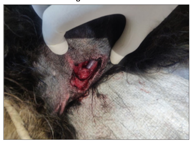
Figure 6.Category III Exposure Jugular Vein Exposed - Infiltration with RIG is must for these Kinds of Wounds

Anti rabies vaccination through ID regime has more immunogenic effect as it is administered directly in the dermis layer and it gets drained to dendritic cells and thus inducing a greater or at least equal immune response with five times less dosage. One dose of Inj. Raksharab costs around 2 USD (150 INR) if given intramuscularly, and 0.4 USD (30 INR) if given by ID route. So, PEP by IDRV is cost as well as dose sparing and more immunogenic as compared with the IM route.