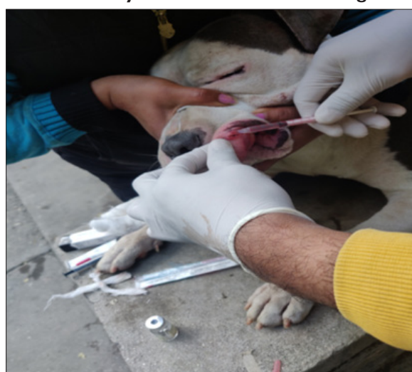
Figure 2 : Local wound infiltration with eRIG in a dog bitten by rabid dog.