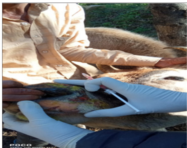
Figure 4. Local Wound Infiltration with eRIG in a Cow Bitten by Lab Confirmed Rabid Dog