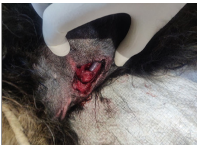
Figure 6. Category III Exposure Jugular Vein Exposed - Infiltration with RIG is must for these Kinds of Wounds

Anti rabies vaccination through ID regime has more immunogenic effect as it is administered directly in the dermis layer and it gets drained to dendritic cells and thus inducing a greater or at least equal immune response with five times less dosage. One dose of Inj. Raksharab costs around 2 USD (150 INR) if given intramuscularly, and 0.4 USD (30 INR) if given by ID route. So, PEP by IDRV is cost as well as dose sparing and more immunogenic as compared with the IM route.