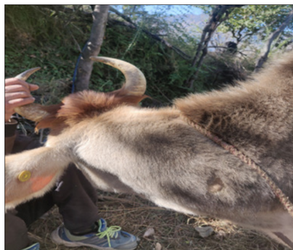
Figure 3.IDRV 0.2 ml in Middle of the Neck in a Cow Bitten by Rabid Dog