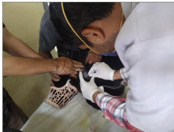
Figure 1.IDRV 0.2 ml in Pre-scapular Region in a Dog Bitten by Lab. Confirmed Rabid Dog

This involved administration of 0.2 ml of rabies vaccine Intradermal (ID) on the pre-scapular region in dogs and in the middle of the neck in lateral side of the cattle. Using an aseptic technique, 1 ml insulin syringe, 0.2 ml (up to 8 units in a 40 unit insulin syringe; i.e. 0.2 ml per ID site) of vaccine was injected into the dermal layer of skin. Insulin syringe was brought parallel to the skin making about 10° angle, after insertion of 30% portion of the insulin syringe vaccine was administered. A raised bleb about 1 cm diameter appeared immediately (Figure 1, Figure 3). While in the IM group, vaccine was administered in biceps femoris muscle in dogs. Furthermore, eRIG was infiltrated into the wounds directly by superficial and deep administration into the wound site so as to cover the entire wound surface till the depth of the wound, to ensure complete virus neutralization on the surface of the wound/s (Figure 2 and Figure 4).