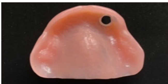
Figure 4. Processed Maxillary Denture with the Gasket