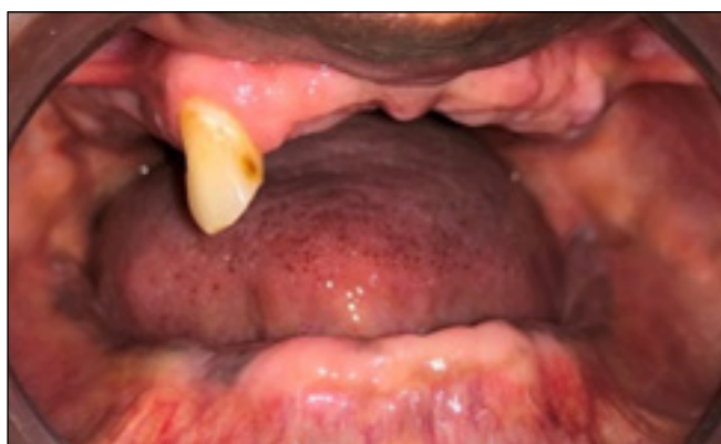
Figure 1. Presence of A Single Natural Tooth 13

A 71-year-old male patient reported to the Department of Prosthodontics & Implantology, SRM Kattankulathur Dental College and Hospital with the chief complaint of missing teeth in the upper and lower arch. On intraoral examination, the patient presented with only one tooth remaining (13) which was periodontally sound with no mobility (Figure 1).