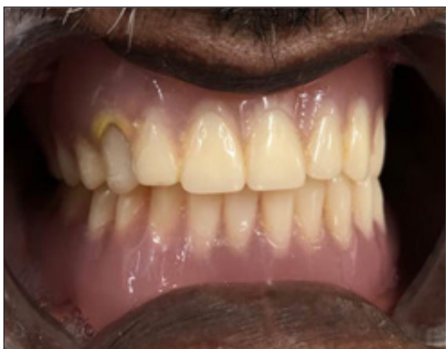
Figure 5. Intraoral View of the Final Dentures