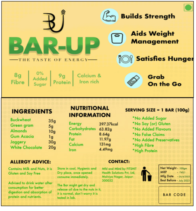
Figure 3.Food Label of the Developed Cereal Bar

The food labels for the developed cereal bars were designed using an application named Procreate, while adhering to the guidelines of FSSAI<sup>12</sup> and ensuring regulatory compliance and the provision of accurate information to consumers. This study aimed to create a comprehensive label that includes allergen information, a barcode for easy product identification, cost details, and nutritional composition. The nutritional composition information empowers individuals to monitor their dietary intake by providing essential details such as calories, proteins, carbohydrates, and fats. The developed food label is depicted in Figure 3.