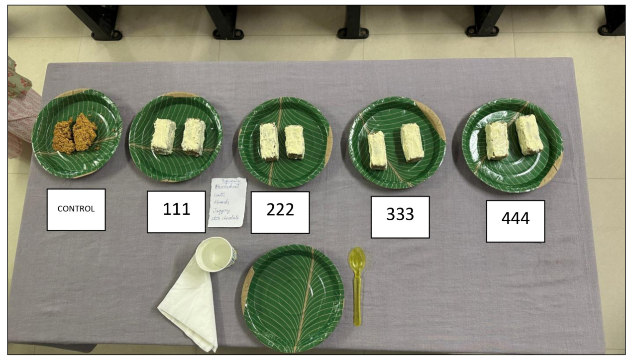
Figure 2.Cereal Bar Samples Prepared for Sensory Evaluation, Showcasing the Variations in Green Gram and Buckwheat Flour Content