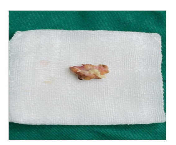
Figure 2.Macroscopic View of Enucleated Specimen

The patient underwent excision and biopsy under general anaesthesia. The mass was identified and very carefully dissected from surrounding tissue. The cyst content appeared to be thick and white, with a waxy-appearing material Figure 2. The surgical wound was closed and healed uneventfully. The specimen was sent for histopathological evaluation.