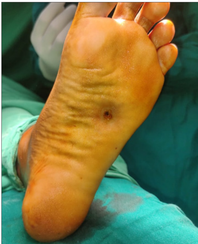
Figure 1. Dorsal Aspect of the Left Foot