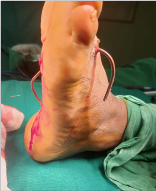
Figure 4. Fistula Probe Inserted into the Left Foot through Dorsal Opening