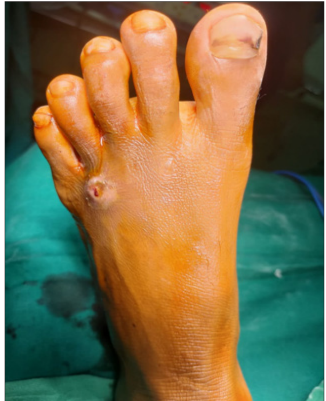
Figure 2. Plantar Aspect of the Left Foot

A microscopic section showed a fistulous tract lined by granulation tissue composed of proliferating capillaries and fibroblasts surrounded by acute on chronic inflammatory infiltrates composed of lymphocytes and multinucleated foreign body giant cells with granuloma and histocytes. Overlying skin showed hyperkeratosis and acanthosis. A fistulous tract with foreign body granuloma was seen.