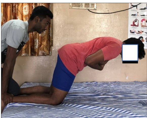
Figure 2. Modified Razor Hamstring

Kneeling in the beginning posture with both knees flexed at 110 degrees and hip extended was required of the participants. To prevent friction between the knee and the surface, both knees were supported using an exercise mat. The therapist made sure that the players' feet were in contact with the ground or the sofa during the activities. Subjects leaned forward at a 90-degree angle with their upper body (Figure 2). They were instructed to hold their position for four seconds and then return to normal. They had to repeat this exercise without fail.