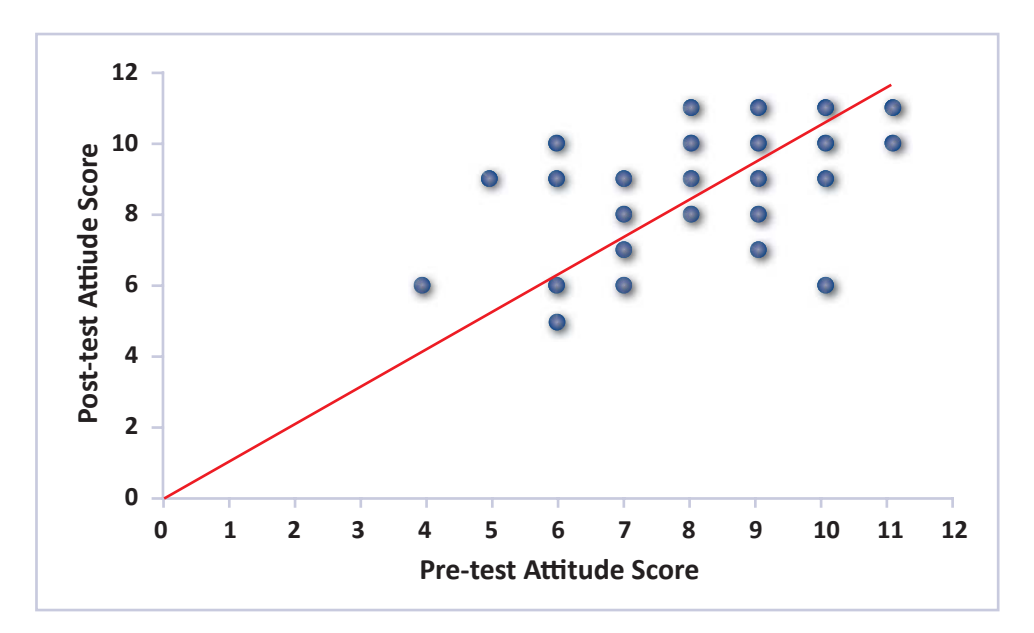
Figure 2 : Correlation between pre & post test scores of attitude