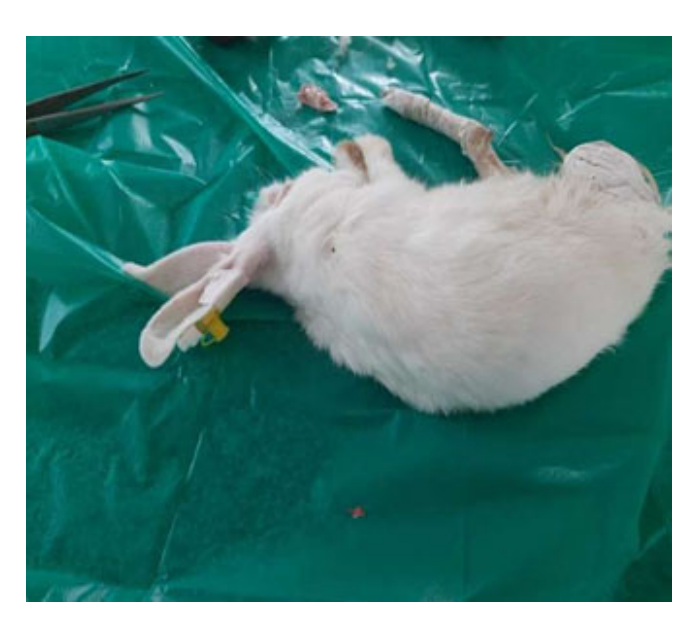
Figure 1. Carcass of the Rabbit Bitten by a Stray Dog. Discussion

The carcass of a rabbit (Figure 1) that was bitten by a stray dog about 2 weeks back was presented for confirmation of rabies at the rabies diagnostic laboratory of the State Institute for Animal Diseases, Thiruvananthapuram, Kerala. There was a bite injury on the ear and one of its legs was amputated following the attack. The animal was under treatment at the Multispecialty Veterinary Hospital of the Animal Husbandry Department for the bite injury. The carcass was sent for post-mortem diagnosis of rabies as it had a clear history of dog bite two weeks back and Kerala is endemic for canine rabies. The animal didn't show any specific clinical symptoms other than lethargy and anorexia. History revealed that the animal was not vaccinated against rabies. Necropsy was conducted and brain tissue was collected. The brain tissue was subjected to a lateral flow Immuno-Chromatography Test (ICT) using a commercial kit (Bionote). Impression smears were prepared from the brain and subjected to Direct Fluorescent Antibody Test (DFAT) using the standard protocol.8 Portion of the sample was also subjected to RT-PCR targeting the N gene using the primers specified by OIE.9 Brain sample was found positive on ICT, FAT, and RT-PCR (Figures 2 and 3).