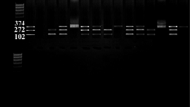
Figure 1.Agarose gel showing ace I genotypes in the field collected Cx. quinquefasciatus obtained after RFLP using Alu I enzyme