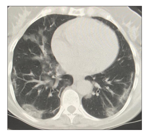
Figure 3.Non-contrast CT scan of the Chest of the 62-year-old female patient reveals peripheral, bilateral (multi-lobar), lower lobes GGO of rounded morphology. The patient was RT-PCR positive for COVID-19

multi-lobar involvement (Figure 5). Pleural effusions, extensive tiny nodules, and lymphadenopathy are rare (Figure 3 and 4).<sup>34, 35</sup> Microvascular dilatations in the area of GGO has been observed on CT scan, probably secondary to inflammation.<sup>36</sup>