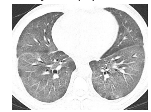
Figure 5.Non-contrast CT scan of the Chest of the 72-years-old male patient reveals peripheral, bilateral (multi-lobar), GGO with crazy-paving pattern. The patient was RT-PCR positive for COVID-19