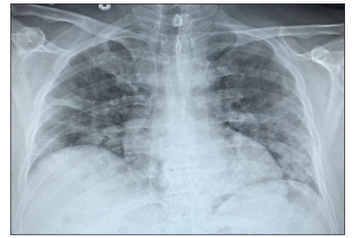
Figure 2.Chest X-ray of 53-year-old female patient reveal low lung volumes with bilateral mid and lower zone airspace opacities with conglomeration in left mid and lower zones and right lower zone suggesting

Figure I.Chest X-ray of 74-years-old male patient reveal bilateral airspace opacities with conglomeration in left mid and lower zones suggesting consolidation. The endotracheal tube is in place. Multiple overlying ECG leads. Radiographic score 4+4=8. The patient was RT-PCR positive for COVID-19