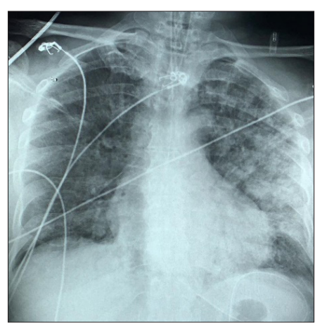
Figure I.Chest X-ray of 74-years-old male patient reveal bilateral airspace opacities with conglomeration in left mid and lower zones suggesting consolidation. The endotracheal tube is in place. Multiple overlying ECG leads. Radiographic score 4+4=8. The patient was RT-PCR positive for COVID-19