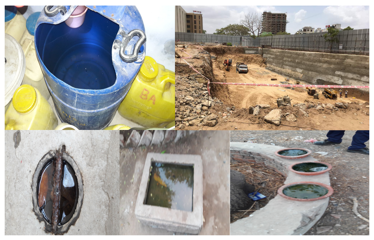
Figure 2. Type of vector breeding places in Ahmedabad affected area in concern with Zika cases