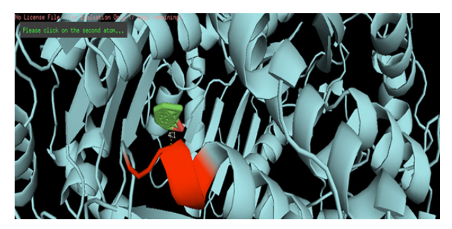
Figure 2.Conformation depicting distance between the carvacrol and binding site of ubiquinol-c-reductase

Figure I.Carvacrol and ubiquinone-c-reductase docked conformation with the lowest binding energy