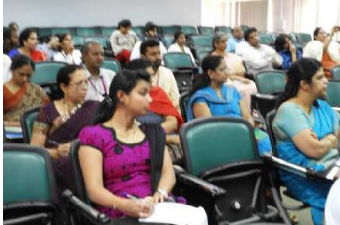
The members of Indian Association for Adolescent Health, Karnataka attending the AGM of the Association in Bangalore