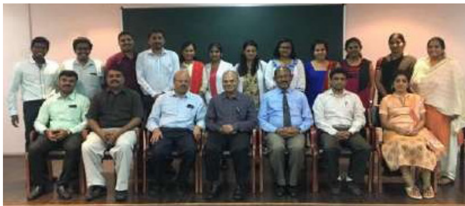
Some of the members IAAH-K who attended the AGM and the Guest Lecture posed for a group photo session