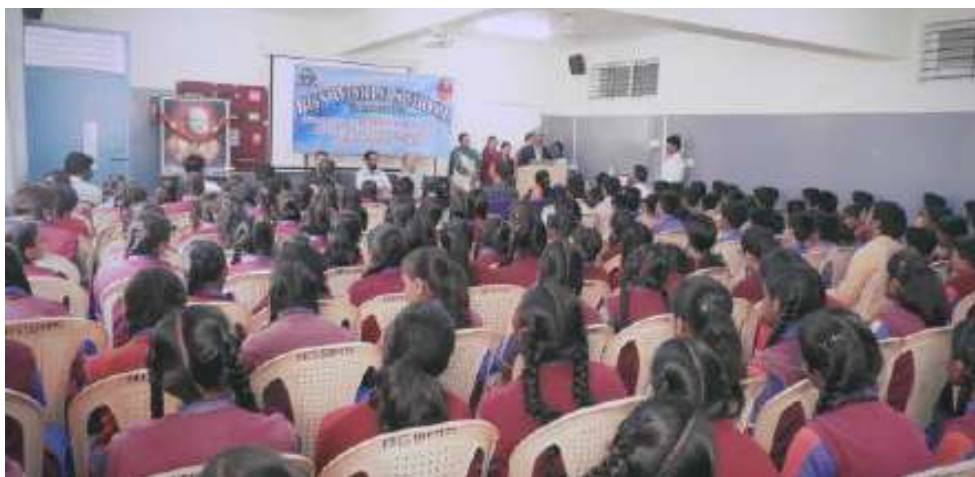
The students of BGS World School attending the award ceremony programme in their school